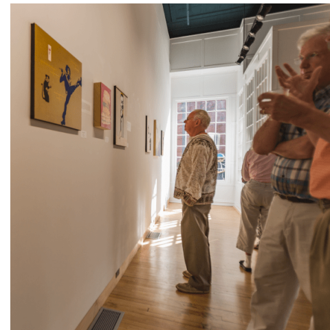
The Elizabeth & Michael Harrington Gallery