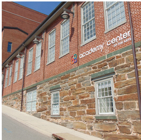
The Joy & Lynch Christian Warehouse Theatre

*Use full name first, then [shortened name] second