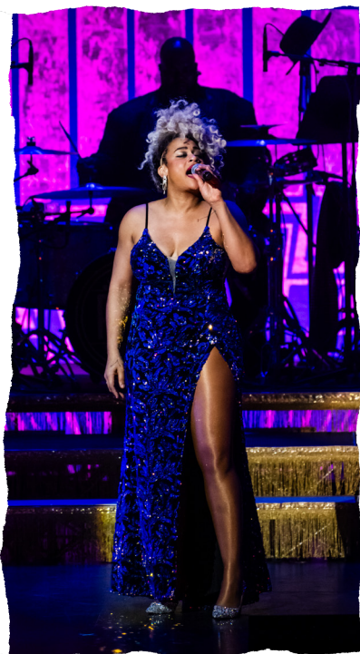
Postmodern Jukebox | March 24, 2024

The Historic Academy of Music Theatre has welcomed extraordinary performers from around the globe. As a cultural beacon in our growing downtown, we bring world-class touring artists to downtown, enriching our community's cultural life while strengthening Lynchburg's vitality and reputation throughout the region.