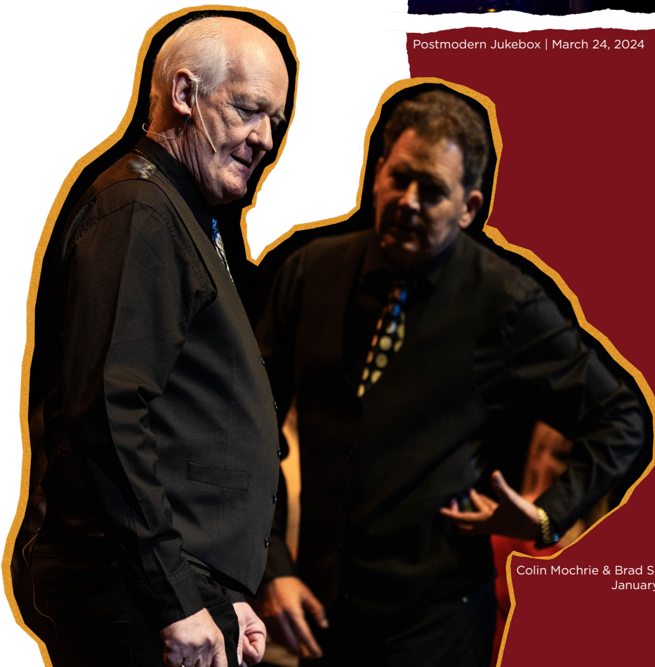
Colin Mochrie & Brad Sherwood January 3, 2024