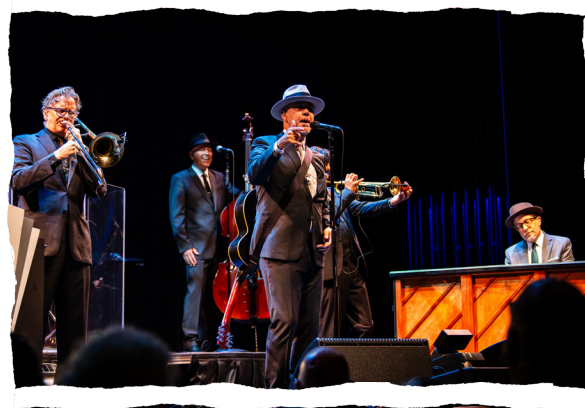
Big Bad Voodoo Daddy | July 20, 2024