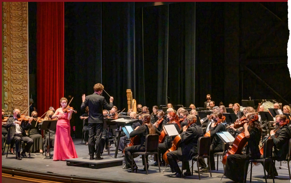
Lynchburg Symphony Orchestra

The Academy Center of the Arts strengthens our region's cultural infrastructure by providing vital performance and event spaces for diverse community partners. Our four versatile venues—the Historic Academy of Music Theatre (835 seats), Joy and Lynch Christian Warehouse Theatre (272 seated/600 standing), the Music Hall (120 seated/standing), and Anne White Gallery (72 seated/200 standing)—hosted a combined 212 rentals this year, supporting both established arts organizations and emerging community initiatives.