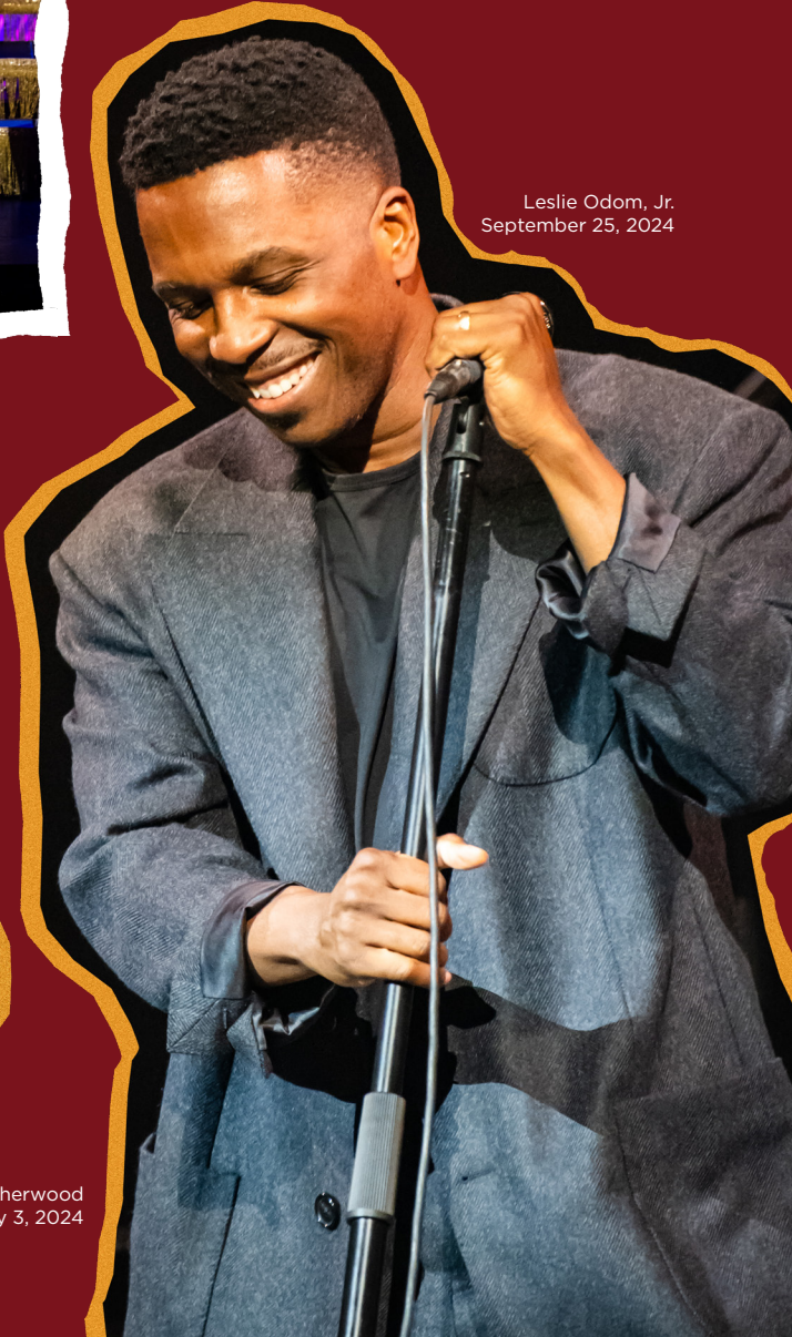
Leslie Odom, Jr. September 25, 2024