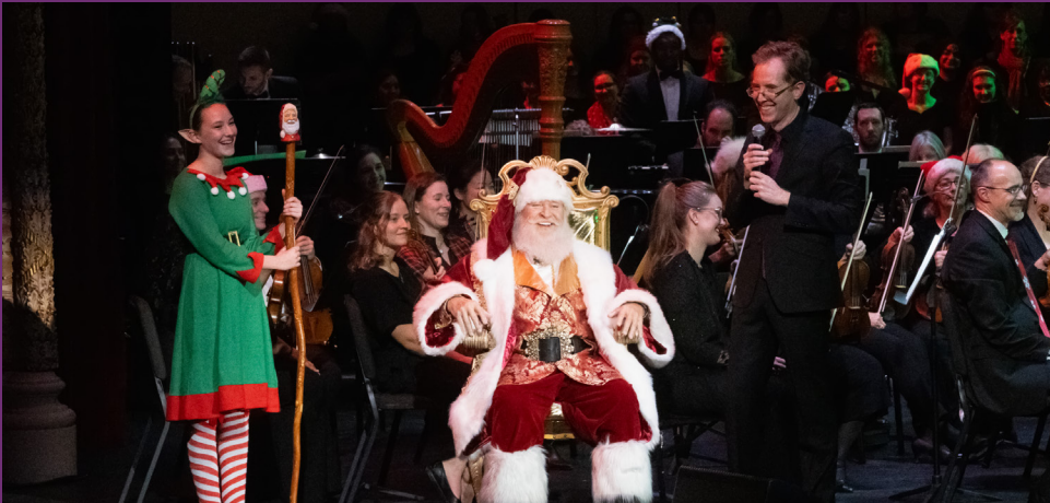
Lynchburg Symphony Orchestra

The Academy's role in delivering community infrastructure is most evident through our partnerships with regional arts organizations. Our three versatile venues—the Historic Academy of Music Theatre, Joy and Lynch Christian Warehouse Theatre, and Anne White Gallery—hosted 221 events this year, providing essential spaces for established organizations and emerging community initiatives.