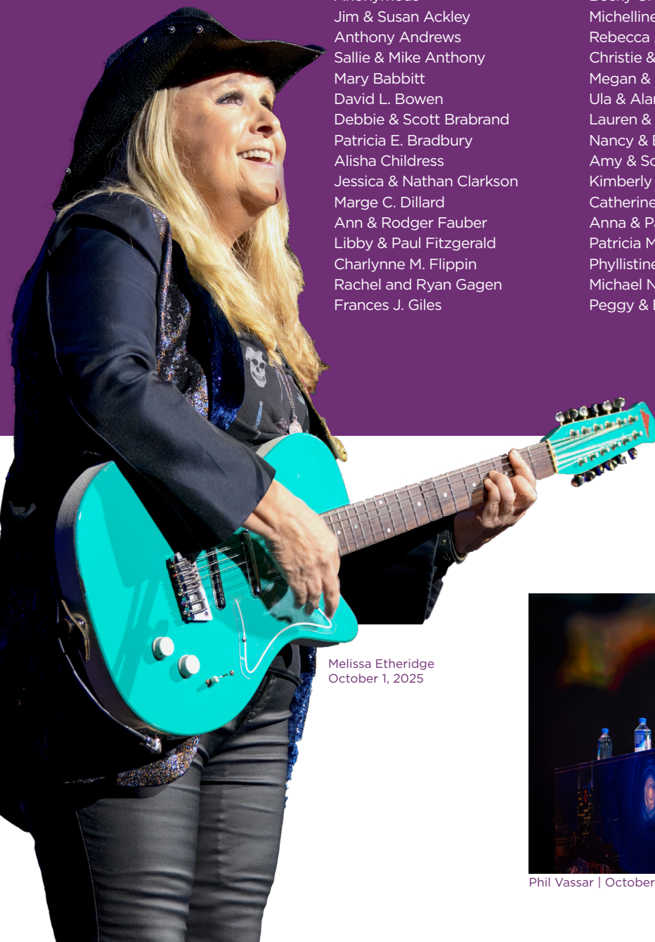
Melissa Etheridge October 1, 2025