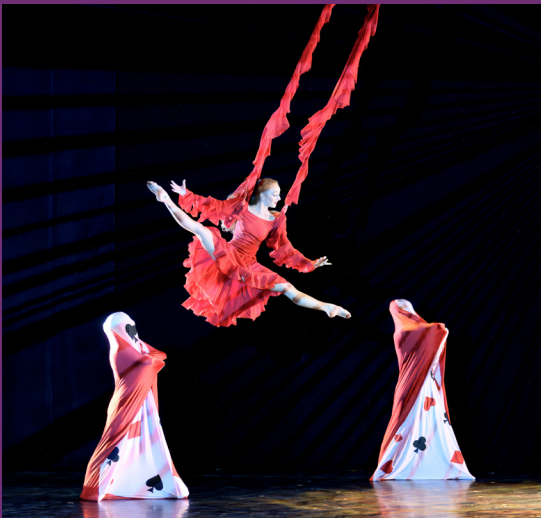
MOMIX: Alice | April 6, 2025

With this support and other contributors to the fund, the Academy may prioritize artistic excellence and cultural enrichment, ensuring that each season features transformative performances for our community. We are grateful to these contributors who are making bold programming possible.