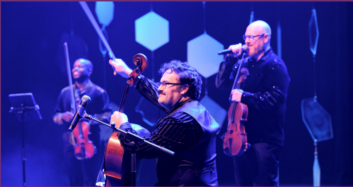
Vitamin String Quartet | October 15, 2025