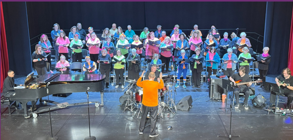
Jefferson Choral Society