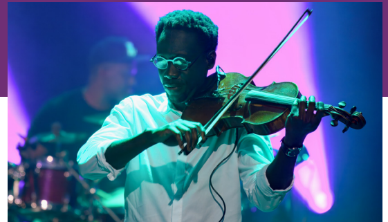
Black Violin | September 28, 2025