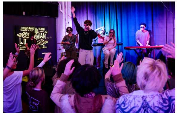
Music Hall Event 2025 - LFK