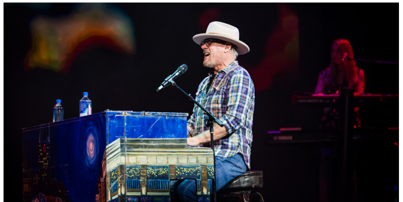
Phil Vassar | October 27, 2025