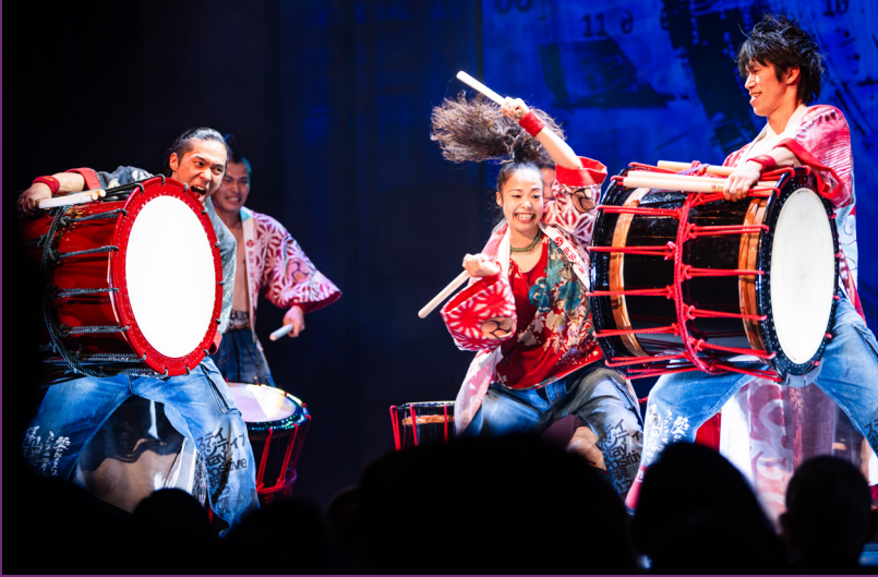
Yamato | February 8, 2025