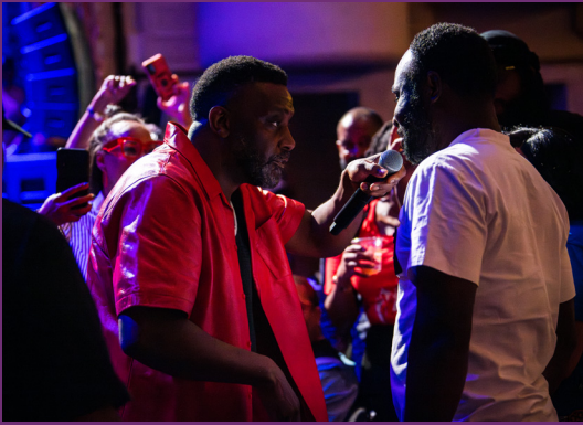
Big Daddy Kane | June 6, 2025

Our Historic Stage welcomed extraordinary artists from around the world, reinforcing the Academy’s role as a cultural destination in Central Virginia and supporting local economic vitality through cultural tourism.