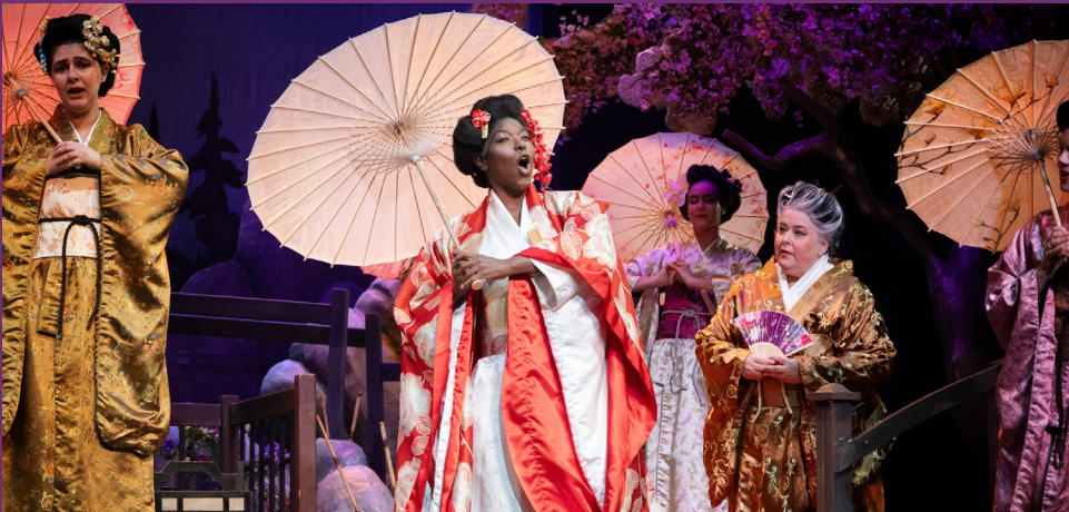
Opera on the James