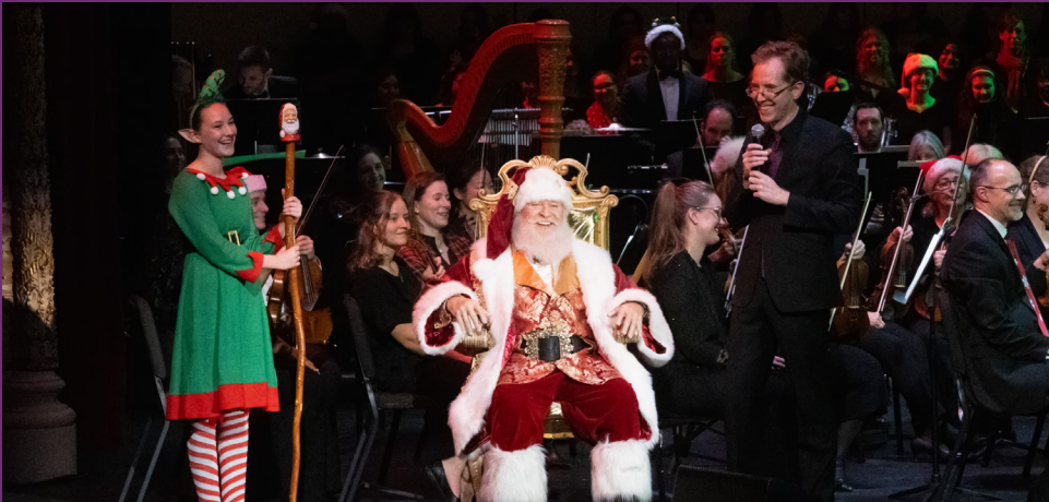
Lynchburg Symphony Orchestra

The Academy's role in delivering community infrastructure is most evident through our partnerships with regional arts organizations. Our three versatile venues—the Historic Academy of Music Theatre, Joy and Lynch Christian Warehouse Theatre, and Anne White Gallery—hosted 221 events this year, providing essential spaces for established organizations and emerging community initiatives.