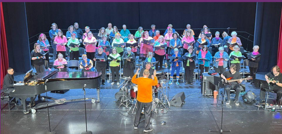
Jefferson Choral Society