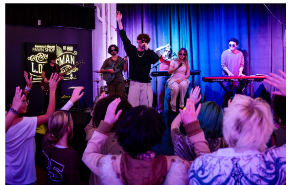
Music Hall Event 2025 - LFK