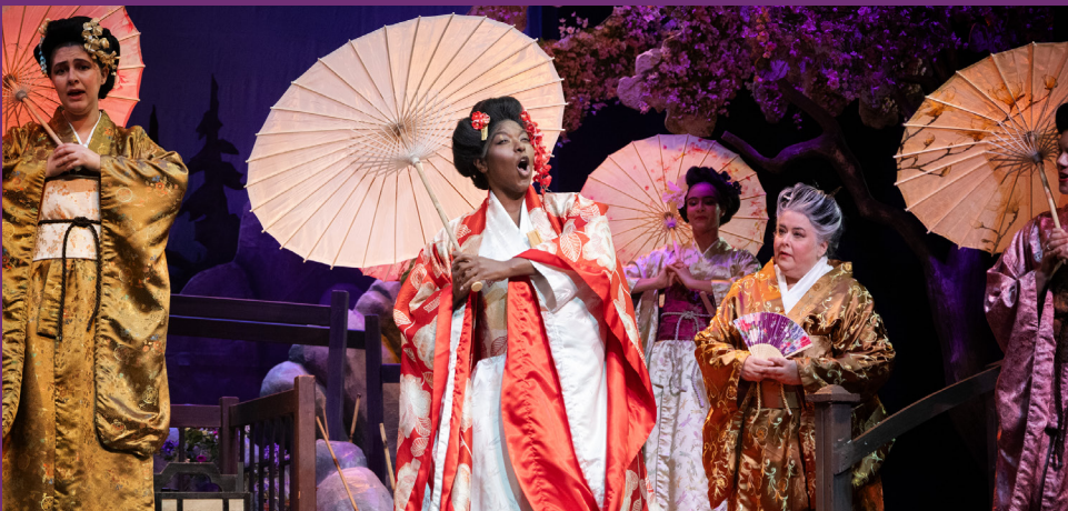
Opera on the James