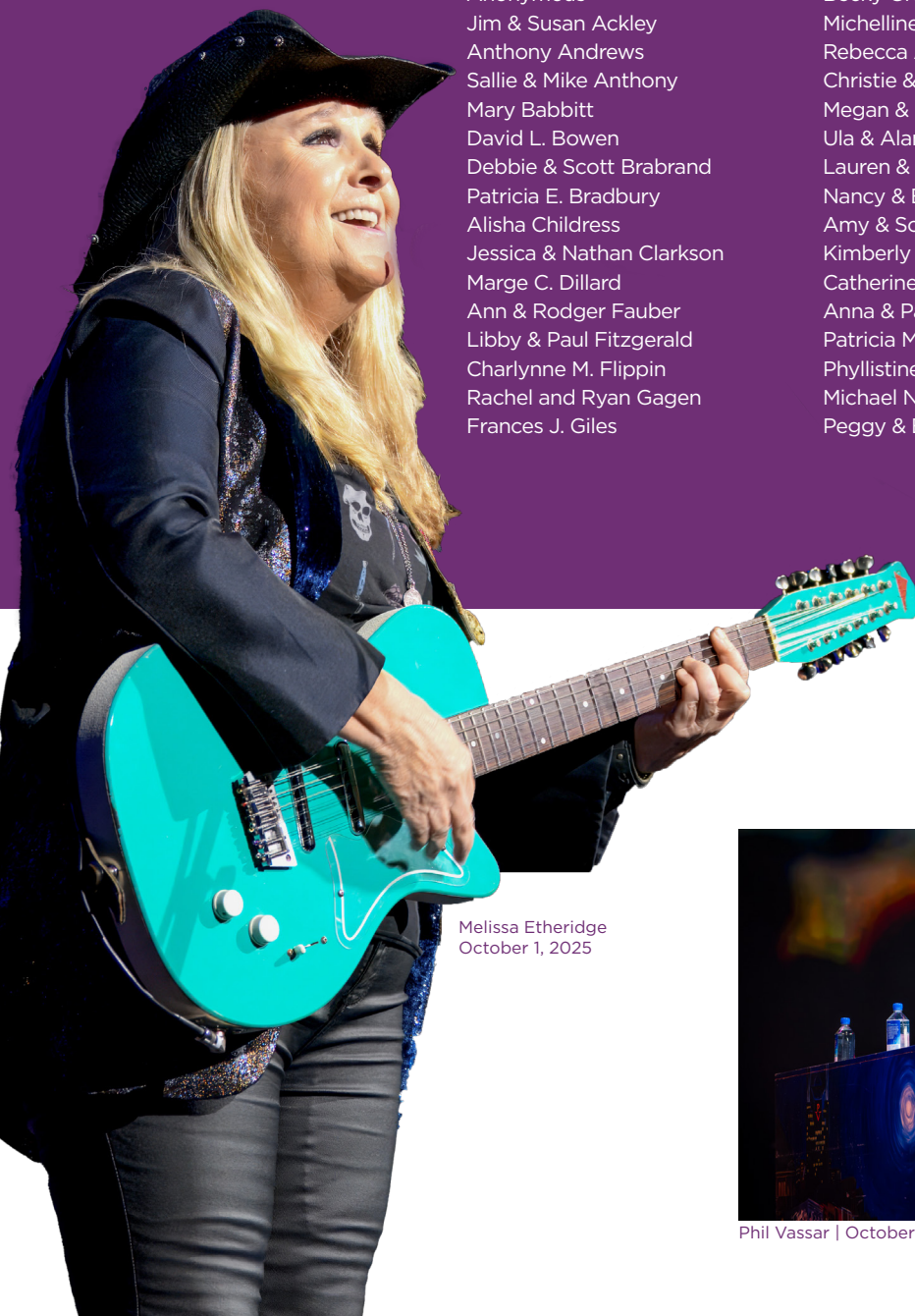
Melissa Etheridge October 1, 2025